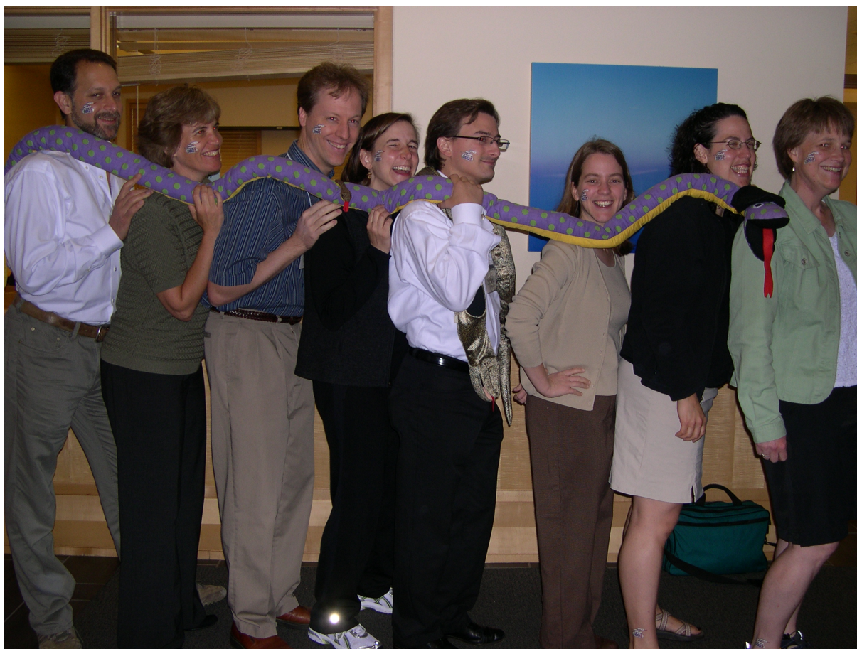
Photo: Members of the leadership council with tattoos and one of their multiple snake mascots.

Lesson learned: Reach out, make connections, and have fun!