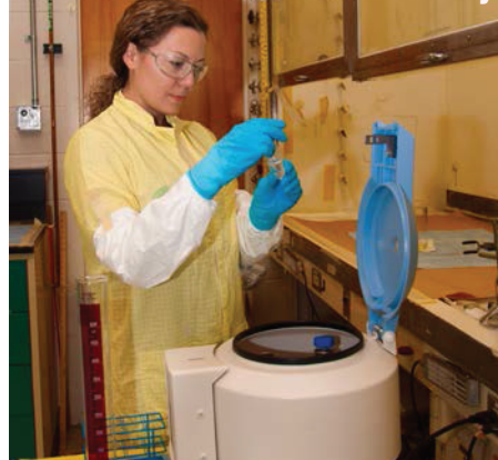
Learn about nuclear forensics